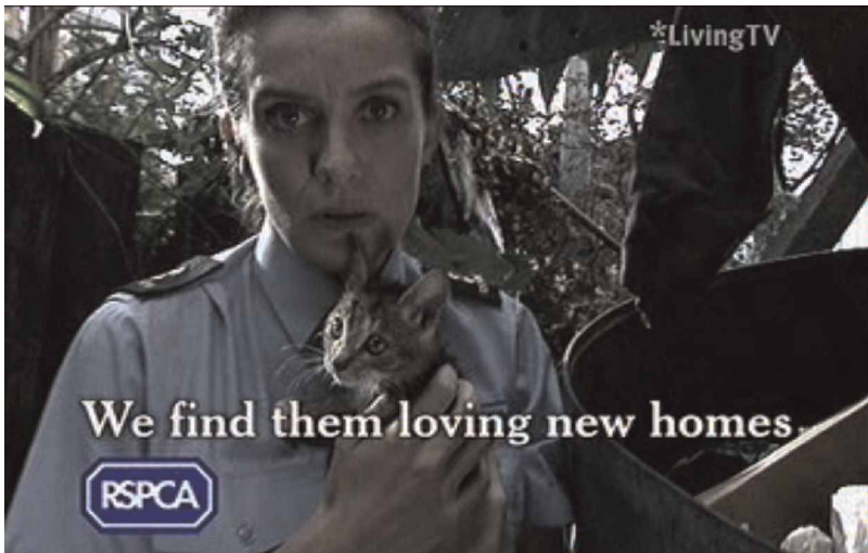
Figure 2. RSPCA television advertisement.

starkly with the Direct Response Press Advertisement run by the Dogs Trust. Again, the advertisement is designed to recruit regular monthly supporters, but in this case it seeks to do so by conveying rather different personality characteristics; namely that it is fun, friendly and caring. Future communications will be addressed to the donor from the 'dog' they have chosen to