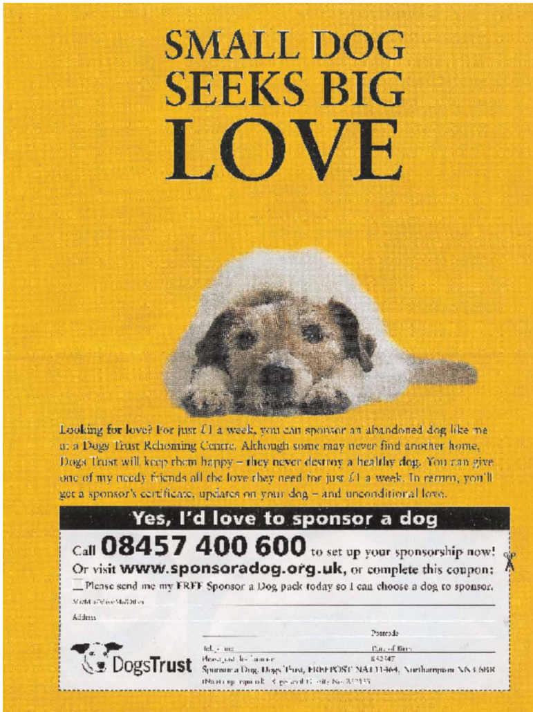
Figure 3. Dogs Trust press advertisement.

sponsor, written in the same style and 'chatty' format as the introductory advertisement itself. The DRTV charity advertisements are similarly styled.